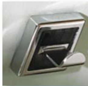
Paradigm Bath Hook in Chrome and Black Crocodile