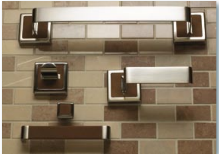
Paradigm Collection in Brushed Nickel and Suede