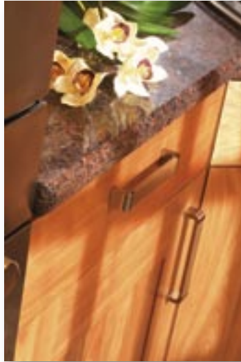
Paradigm Pull in Brushed Nickel and Suede