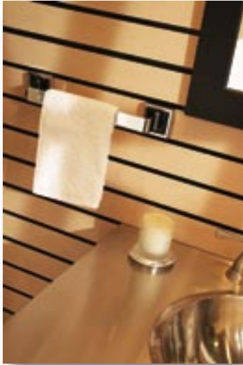
Paradigm Hand Towel Bar in Chrome and Black Crocodile