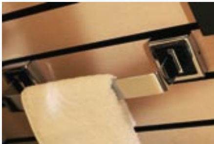
Paradigm Hand Towel Bar in Chrome and Black Crocodile Close Up