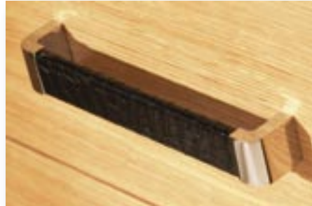
Paradigm Pull in Chrome and Black Crocodile Close Up