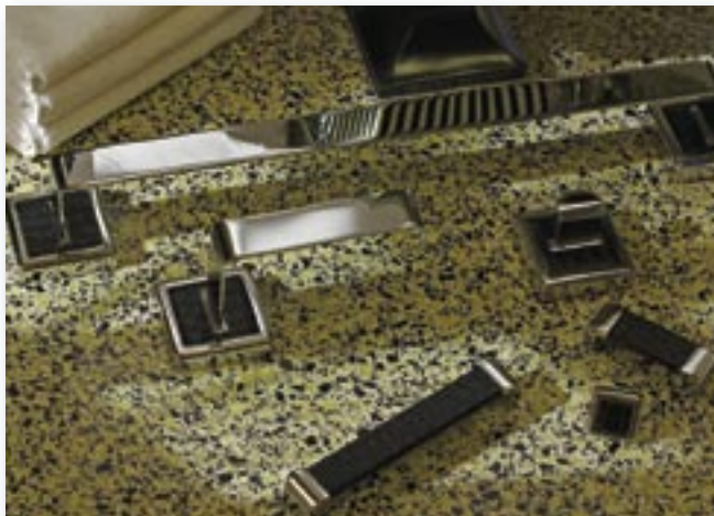
Paradigm Collection in Chrome and Black Crocodile

Enhanced with polished chrome and brushed nickel accents, Paradigm’s ultra modern look is ideal for adding an unexpected and trendy touch of class to kitchen and bath cabinetry. “It will appeal to a higher end consumer who loves luxury, and doesn’t mind paying for it,” says Morea, who explains that she wanted to design a special luxury line for her kitchen and bath showroom clients.