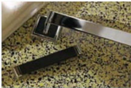
Paradigm Hand Towel Bar and Pull in Chrome and Black Crocodile