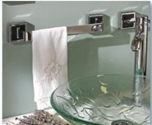
Paradigm Collection in Chrome and Black Crocodile